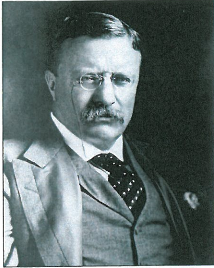
Theodore Roosevelt was a tireless advocate of wildlife conservation, and not just for huntable animals. He also worked with nonhunters to conserve songbirds and other species.

Should hunters fear a conservation coalition that includes nonhunters?