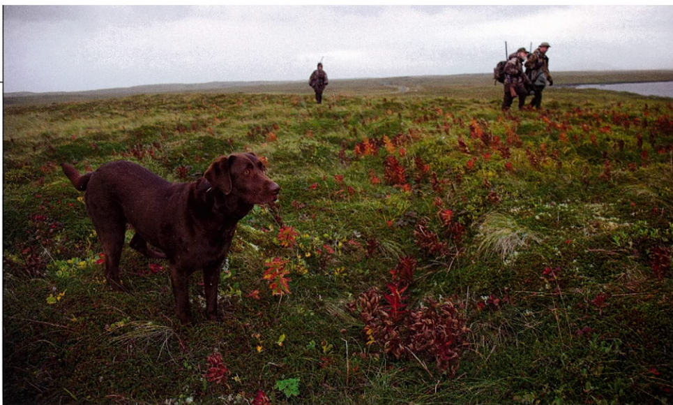
Waterfowl hunters, human and canine.

Blind faith and empty rhetoric are not enough, not when the future of wildlife is at stake. How will wildlife be cared for and managed? Why would citizens who have little or fleeting engagement with wild animals willingly pay for their protection and management? Who will manage the superabundant species, the threatening and dangerous carnivores, the disease agents passed between wildlife and humans? These, of course, are practical questions. There are also more philosophical ones. Who has the right to take away the legal harvest of wildlife by individuals for their own sustenance and well-being while industries are encouraged and often subsidized to harvest fishes and domestic animals in their billions for food and profit? Further, in a world altered massively by human commerce and abundance,