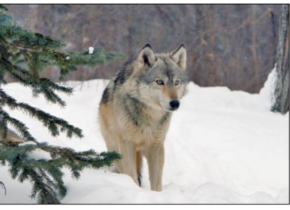
Scientific management is required to maintain some equilibrium between wolf numbers and their prey species.

will we decide what is reasonable? And how will we decide what is reasonable? Will it be when our hunting opportunity is diminished just a little or only when it has been drastically curtailed? And what effect will these positions have on how we are perceived by the mainstream public? It might be easy to say we don't care about that, but the reality is we had better care a great deal. We need public support and where we stand on wolves can make a big difference in how much we get and how much we maintain.